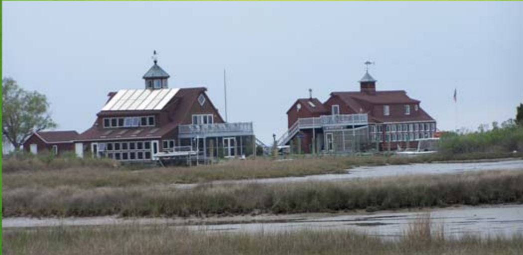
Port Isobel Education Facility