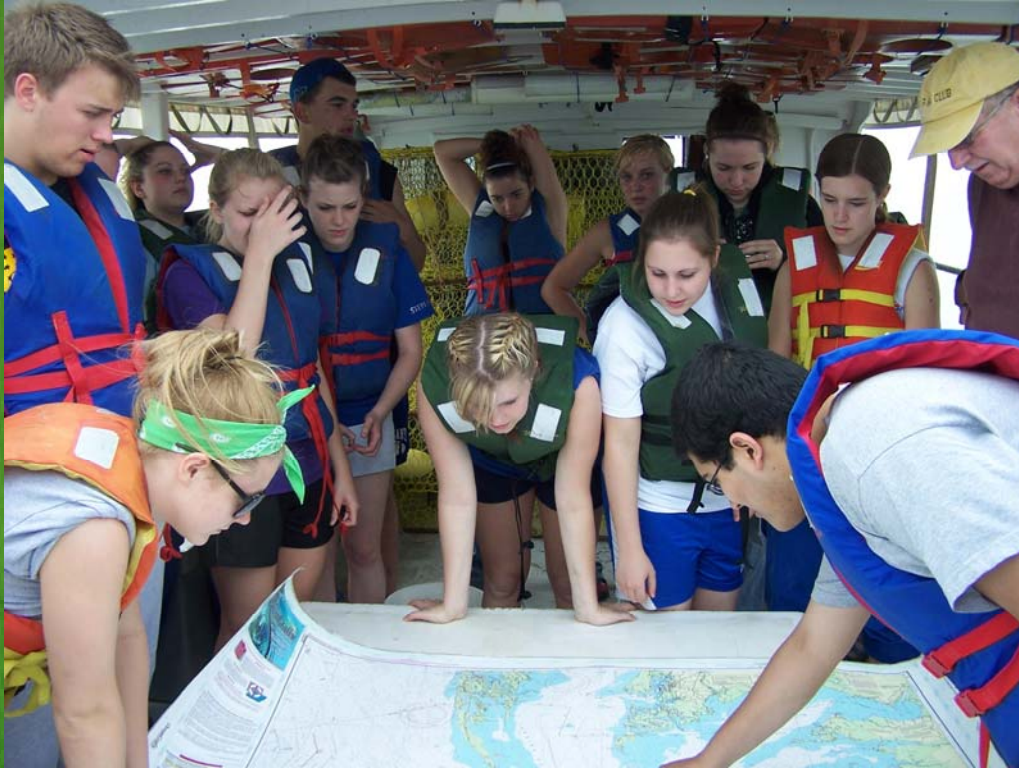
Finding our location on the map