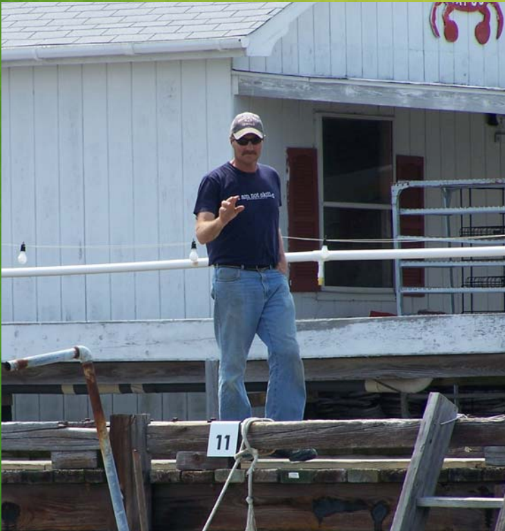
The Mayor of Tangier