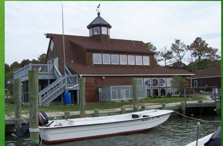
Education Center and Cafeteria