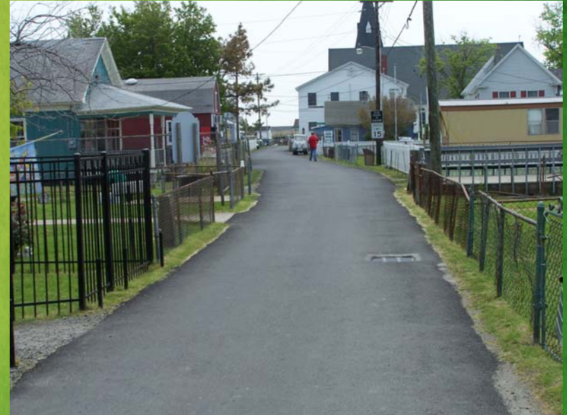
The main street of Tangier